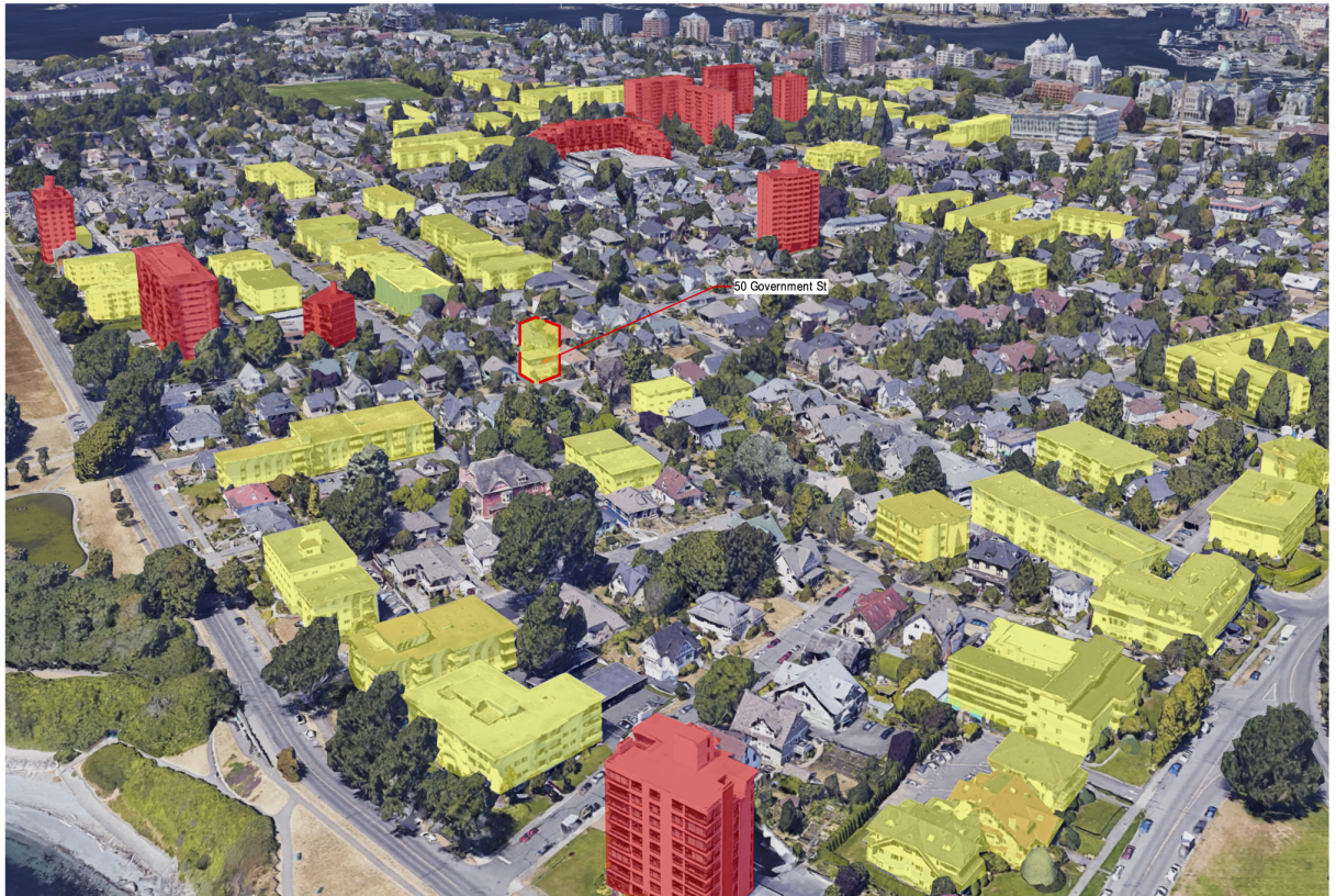
BUILDING TYPE DIAGRAM: James Bay's residential buildings consists of a mix of single family, townhouse, mid-rise, and high-rise.

The design aims to celebrate this contrast by offering something to the community; most importantly the prominent piece of public art described above. We believe that our proposed building will become a recognizable landmark.