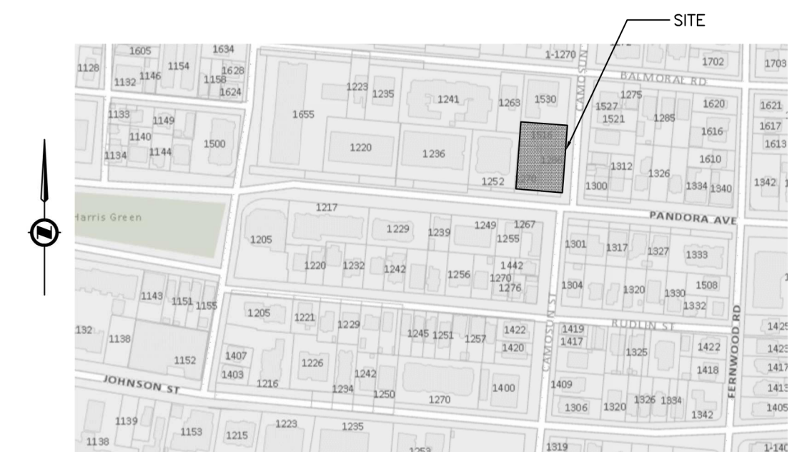
KEY PLAN NTS