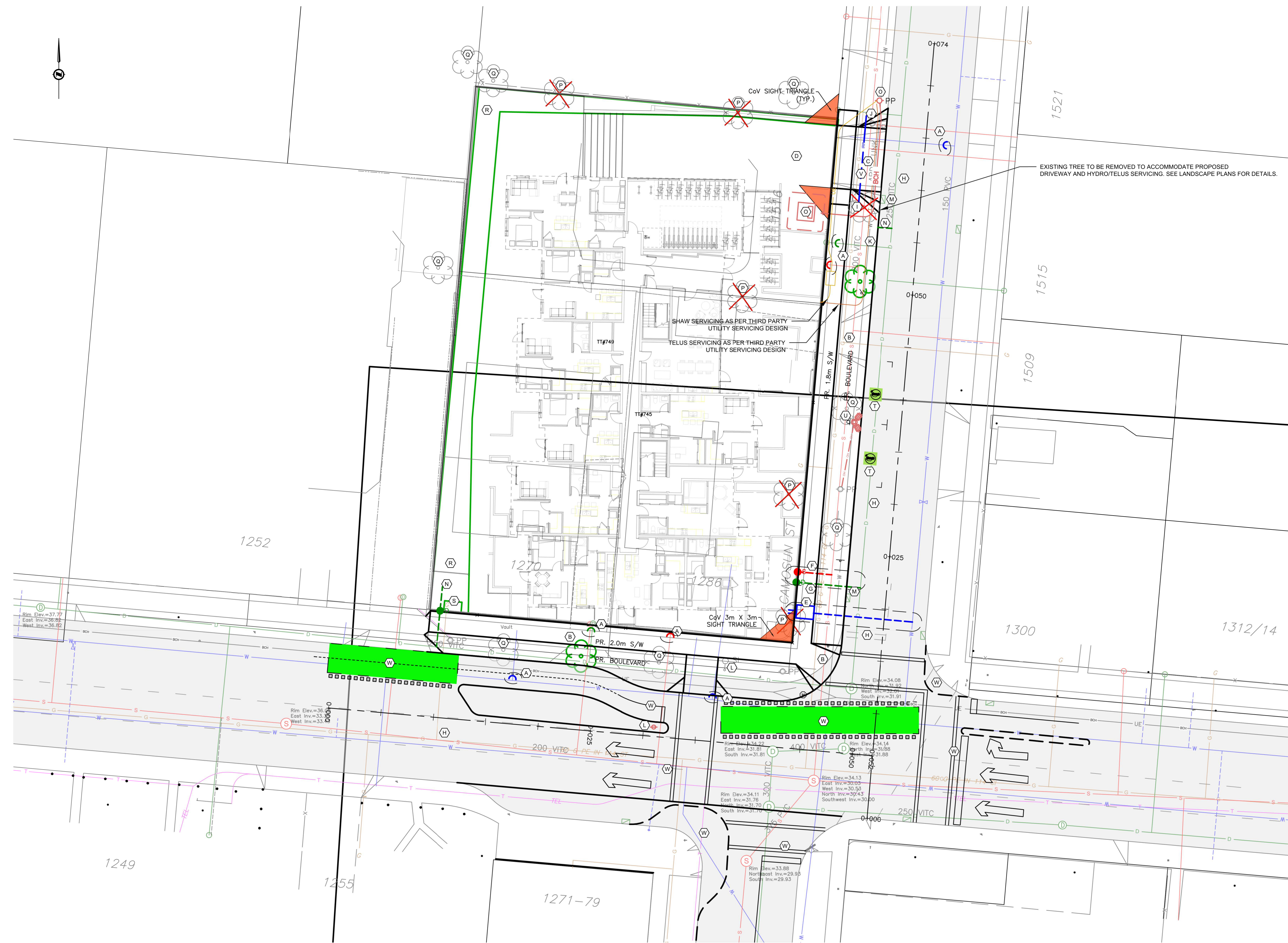
SITE PLAN H 1:200