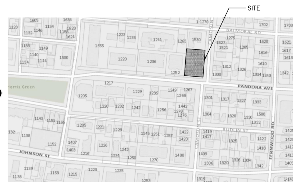
KEY PLAN NTS