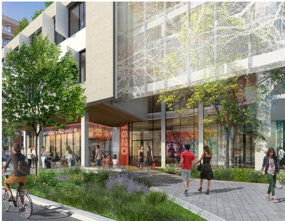
View of Blanshard Street Frontage

This Project is exceptionally well situated in a highly walkable and bikeable location that is also directly serviced by public transportation along the Blanshard Street and adjacent Douglas Street and Fort Street corridors. The designated AAA two-way protected Fort Street bike lane runs perpendicular to the Proposal while the recently completed Vancouver Street shared use neighbourhood bikeway is located two blocks to the north. The Proposal offers 192 long term bicycle parking stalls in a conveniently situated bicycle storage room at grade, providing more secure bicycle parking stalls for residents than required by City zoning requirements. 22 oversized cargo