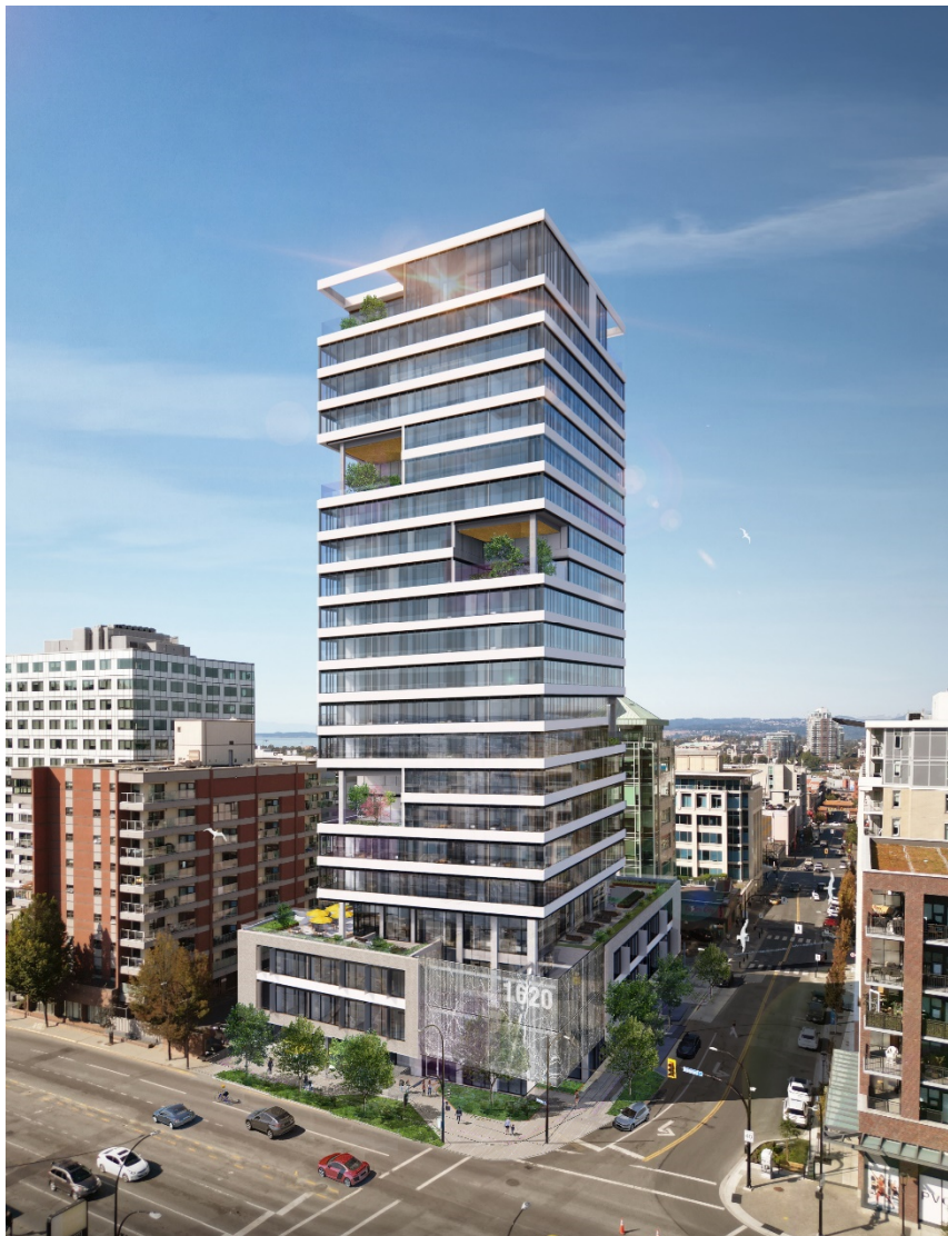
Perspective – Looking Southwest

This Development Proposal envisions a 22-storey building containing 13,327 sq.m. of gross floor area incorporating 156 residential units and 4 commercial units at grade. 107 parking stalls are provided in a three storey underground parkade and 192 bicycle parking stalls, including 22 cargo bikes, are provided in a secure bike room with at grade access.