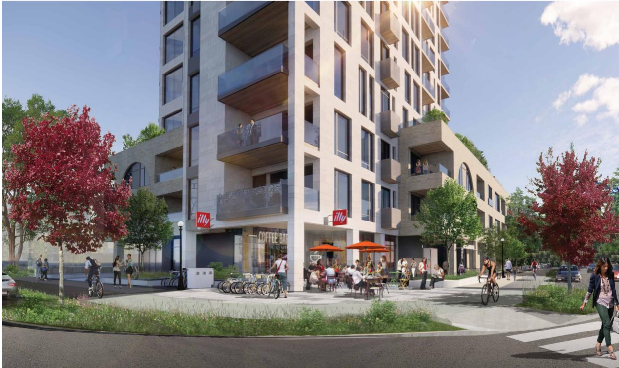
View of the corner plaza at Montreal & Quebec Streets

This proposal seeks to support both the local residential and tourism experience by contributing a landmark building to the harbour skyline that is uniquely of James Bay; at the same time, the project provides needed housing and comfortable social space for the neighbourhood. The human scale, active uses, ample beautiful furnishings and rich landscaping will greatly improve what is now a desolate corner parking lot.