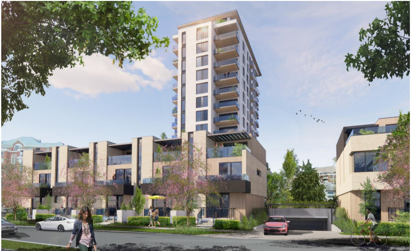
Rhythm of townhouses along Kingston Street

The density increase is requested considering the project's contribution to these neighbourhood amenities and municipal goals. The increase is also rationalized by how successfully the design responds to the site's unique adjacencies and mitigates impacts of the proposed density on the surrounding older multi-family developments (detailed in 'Design and Development Permit Guidelines' below). We have also engaged in a formal land lift analysis process with the City of Victoria and further details of our comprehensive Community Amenity Contributions can be found in the attached " Community Amenity Summary ".