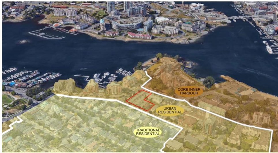
Aerial context view with OCP Urban Place Designations

The subject property is in the James Bay neighbourhood, on the boundary of the Core Inner Harbour area. While in the OCP the properties are identified as 'Urban Residential', the proposal takes a nuanced and site-specific approach: the architectural design makes a transition in building massing and character between the Core Inner Harbour and James Bay Residential areas.