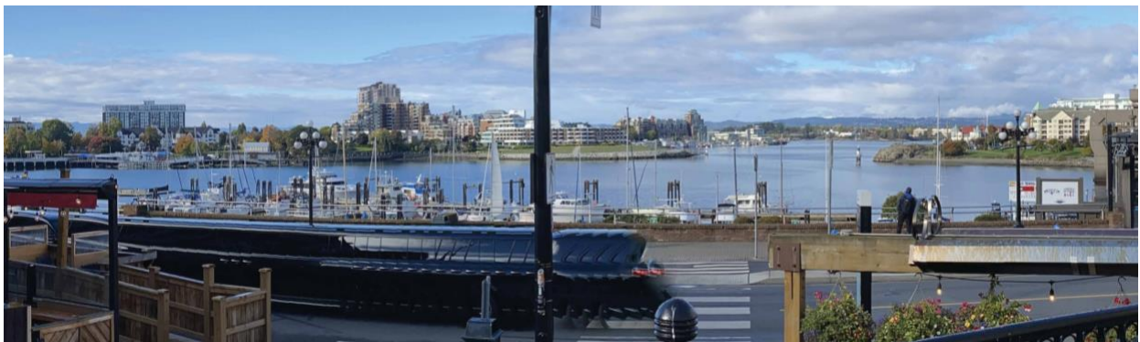
Perspective of the proposed building from Bastion Square