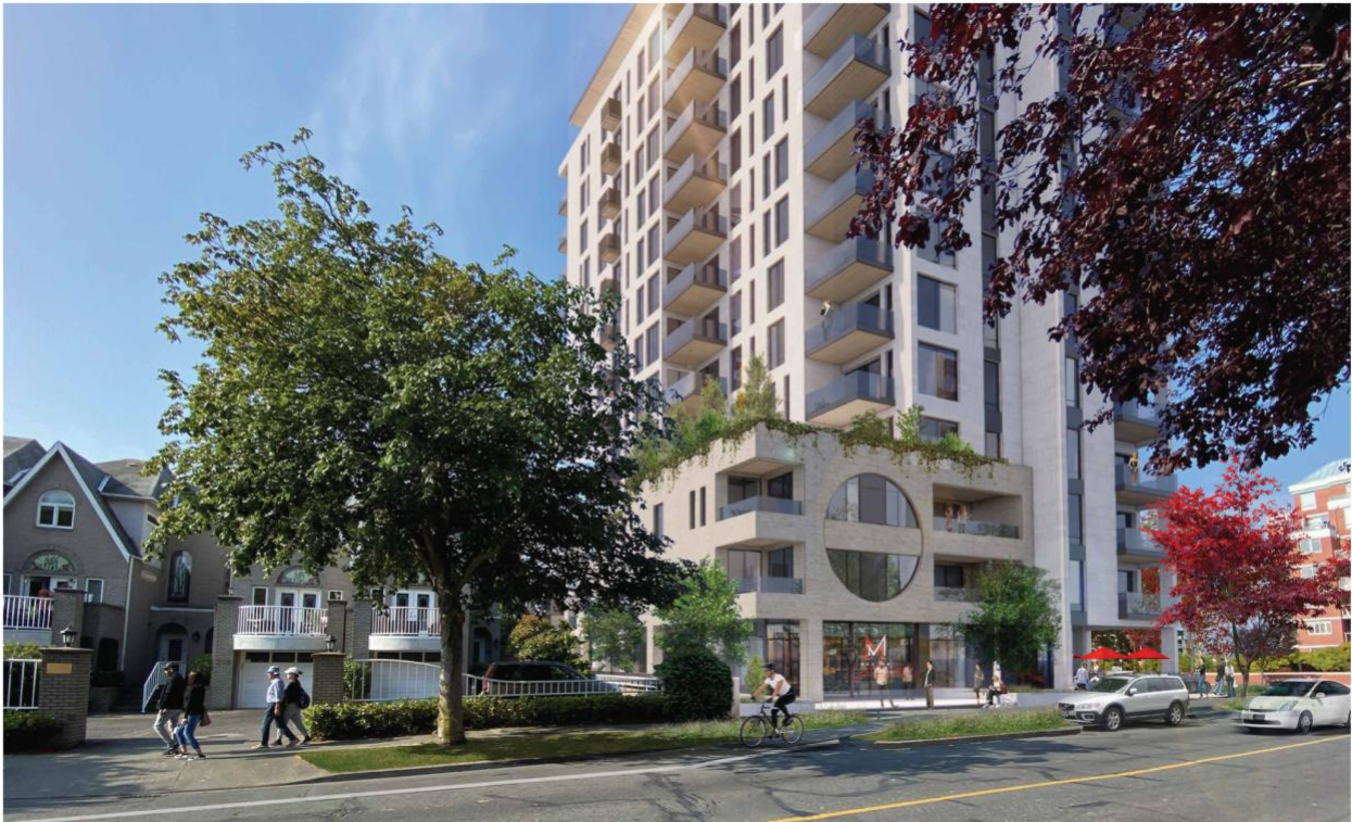
Rendering of the Commercial Space and Podium from Quebec Street

The palette of colour and material is contextually responsive, picking up on the textures and tones of the Inner Harbour District and historic buildings of brick and stone. Similar to the adjacent brick clad residential buildings the podium is clad in clay brick; however, the selected colour is a lighter, warm 'wheat' colour, complemented by warm wood-toned soffits. The tower is clad in larger-scale cementitious panels with a limestone-grain finish, referencing the materiality of historic buildings in the area. These panels help to visually lighten the tower and accentuate the shadow play on its angled form. The townhouse clusters continue with brick walls, however there it is integrated with wood cladding and soffits for a more domestic character. The townhouses and podium are further softened by the integration of extensive landscaped planters, which wrap around the buildings on Kingston Street and help to define public outdoor areas along Montreal and Quebec Streets.