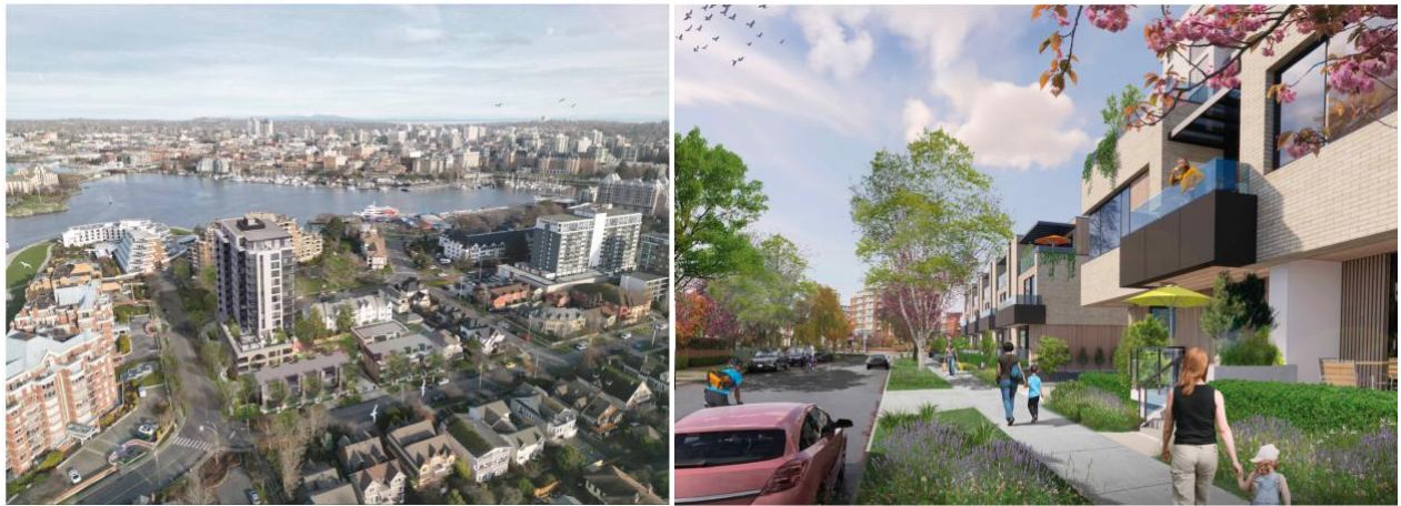
Overall aerial view (left) and street level view of the townhomes along Kingston Street (right)

The project is comprised of four distinct buildings: one mixed-use tower and three groups of two and three-storey townhouses. The tower is positioned on the Northern corner of the site, proximate to the taller buildings along the waterfront. The townhouses are located along the Southern boundary of the site, reflecting the height and scale of the houses and townhouses across Kingston Street. Through the distribution of the building floor area and height on the property, the architectural forms make an effective transition from the Inner Harbour District to the Urban Residential area.