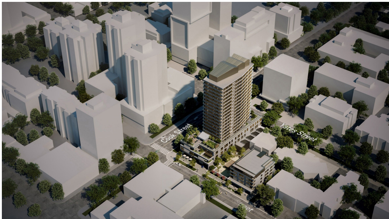
Aerial sketch view of the Development Proposal, illustrating the transition in building height and scale between the downtown core and Fernwood neighbourhood.

To contribute to a positive urban transition at the edge of downtown, the Project takes the form of a 21-storey high-rise within the Core Residential area and a 5-storey mid-rise within the Urban Residential area. The building heights have been carefully calibrated to balance building program requirements with the provision of on-site open space, generous setbacks that shape comfortable street frontages and relationships to neighbouring buildings and facilitate essential construction efficiencies. The proposed overall floor space ratio is 5:1 . An increase in the permitted height and density is