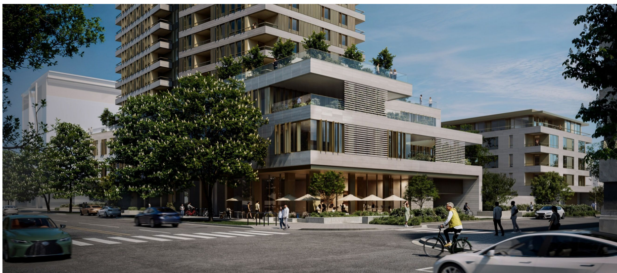
The three-storey commercial podium continues the human scaled frontage along Cook Street. At the Cook & View Streets corner, the public realm is activated by a corner café and tiers of landscaped roof decks above.

The Project will have a positive impact on Fernwood residents by addressing multiple key neighbourhood objectives: