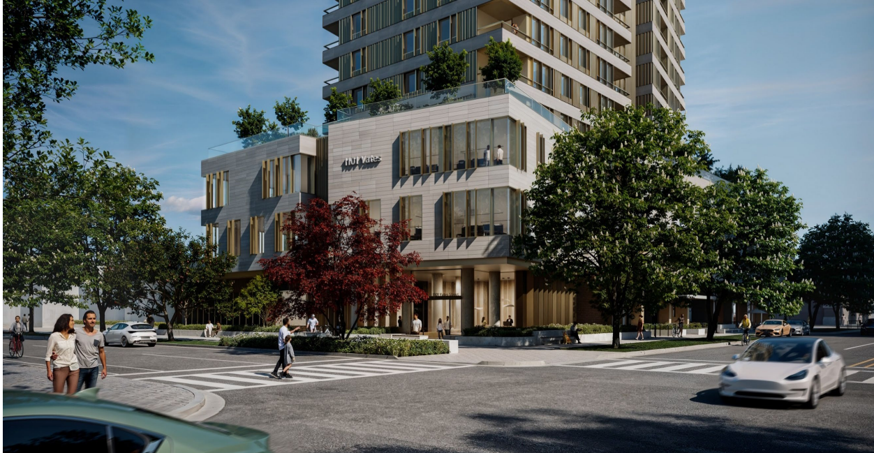
The commercial office entrance defines the landscaped plaza at the corner of Yates and Cook Streets.

profile, and optimized housing livability and efficiency. In terms of neighbourhood level construction impacts, we recognize the surrounding area is undergoing intense and prolonged transformation and the Applicant is committed to maintaining clear communication with the neighbourhood and adhering to bylaws and best practices throughout the Project's construction process.