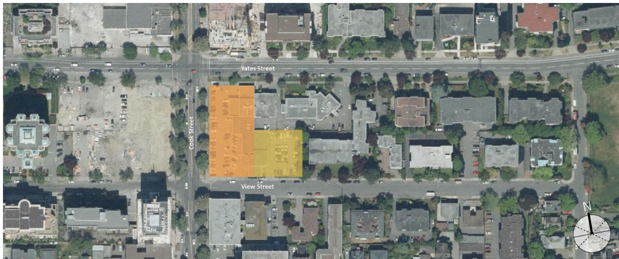
Aerial photo of the 1101 Yates property, highlighting areas by policy use designation: Core Residential (orange) along Cook Street and Urban Residential (yellow) at the Southeast corner of the site.

Policy Context In the current Official Community Plan (OCP), the site forms a transition between the downtown 'Core Residential' area and the lower density 'Urban Residential' area. Salient aspects of these designations include: