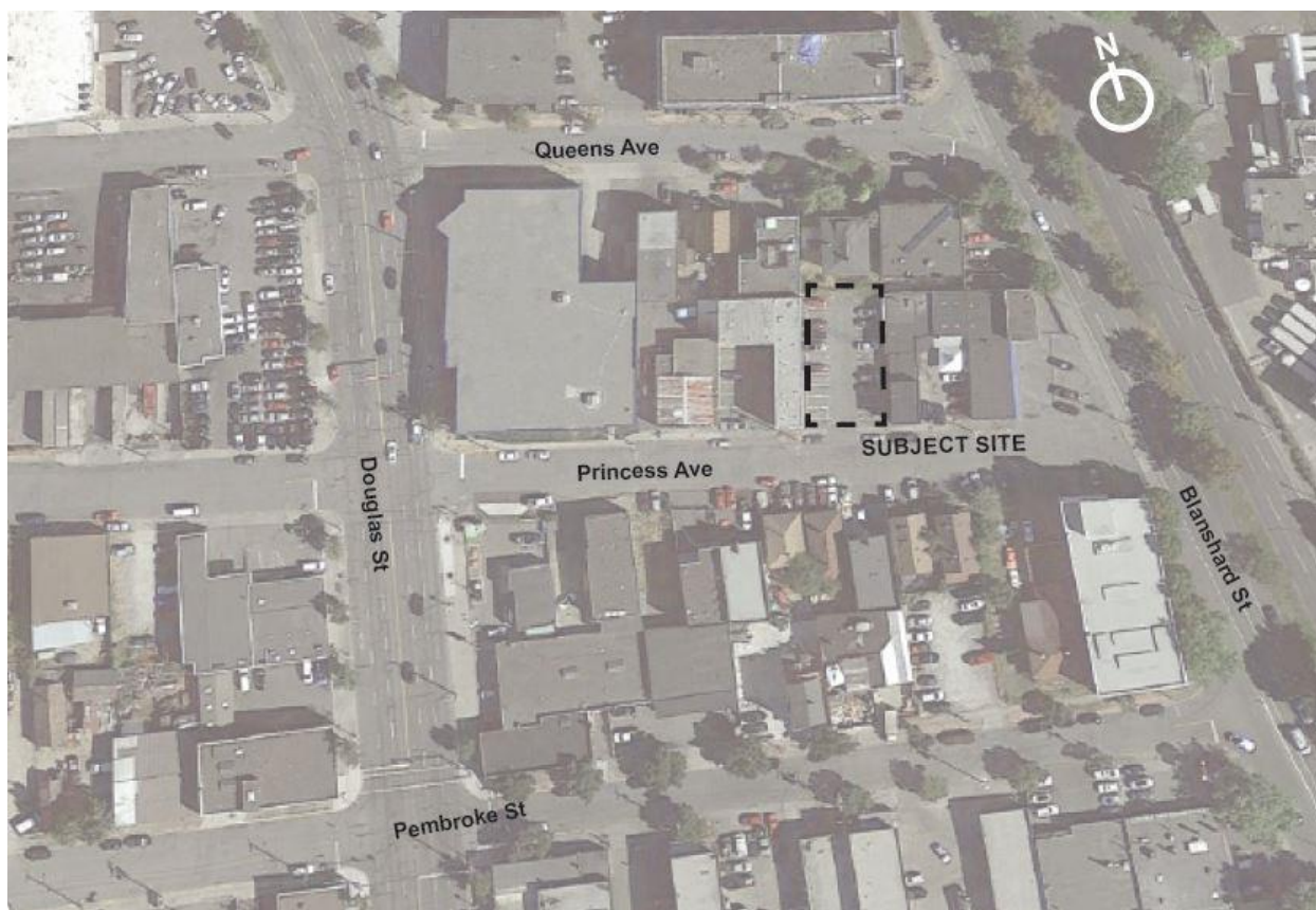
FIGURE 1. SUBJECT SITE

The proposed development site is located at 736 Princess Avenue in the City of Victoria. See Figure 1 .