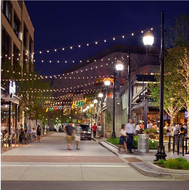
Coquitlam Centre

Utilizing the infrastructure that was previously installed to support this future use. This installation enhances ambiance and creates an additional “third space” for hotel guests, business patrons and neighbours to gather into the evening, bringing further community connection to this area.