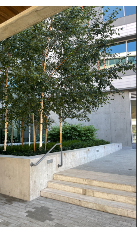
STEPPED RAIN PLANTER WITH INTEGRATED SEATING