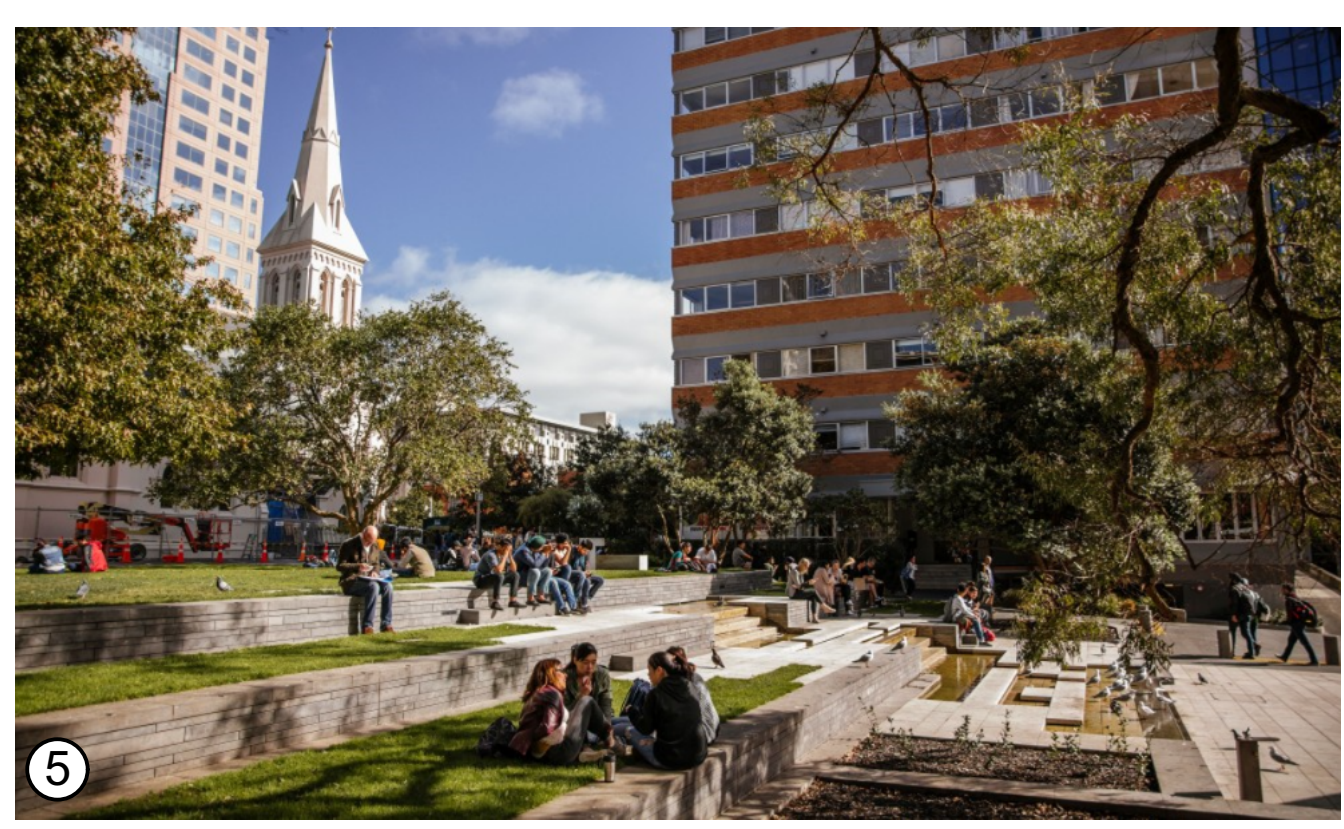
STEPPED LANDSCAPE WITH PLAZA SPACE + SEATING