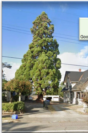
Figure 8: Sequoia Tree for Retention

Good Fair/good Growing within confined rooting environment - between existing buildings on East and West sides and driveways for each property. Existing asphalt on West side lifted extensively by roots and root collar expansion, heavily compacted on East side from existing gravel driveway, large (60cm diameter ~) competing leader forms on South side at 4m above grade.