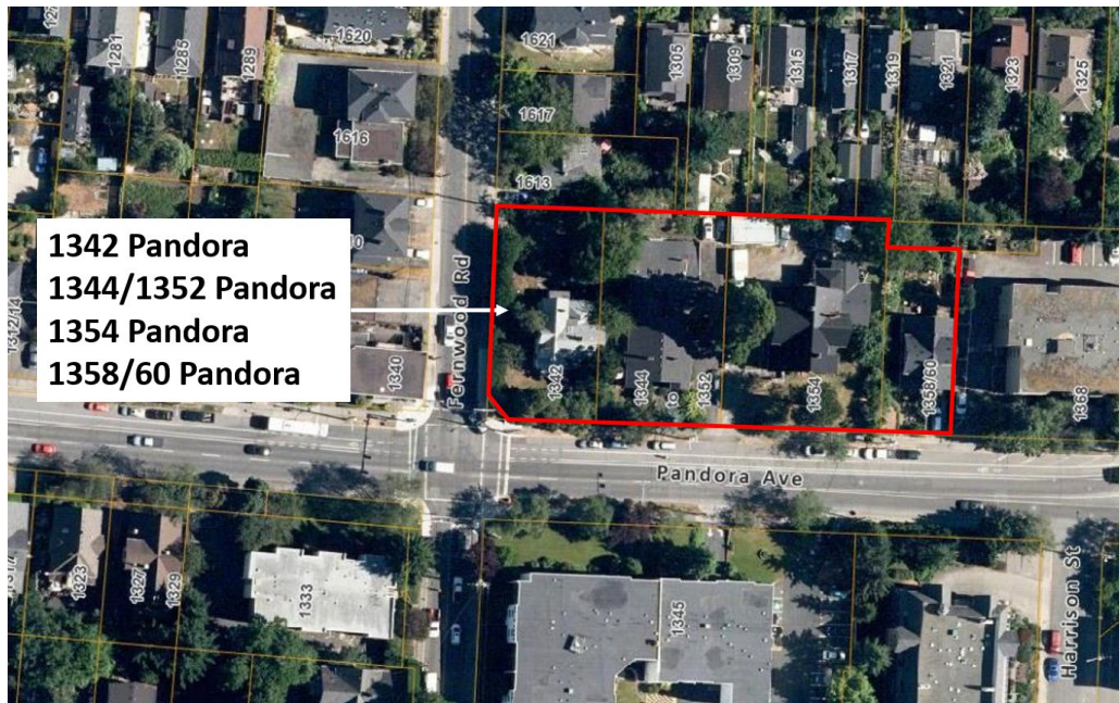
Figure 1: Location / Property Plan

The sites, collectively, contained 22 older and unsuitable rental units, of which 15 are currently occupied.