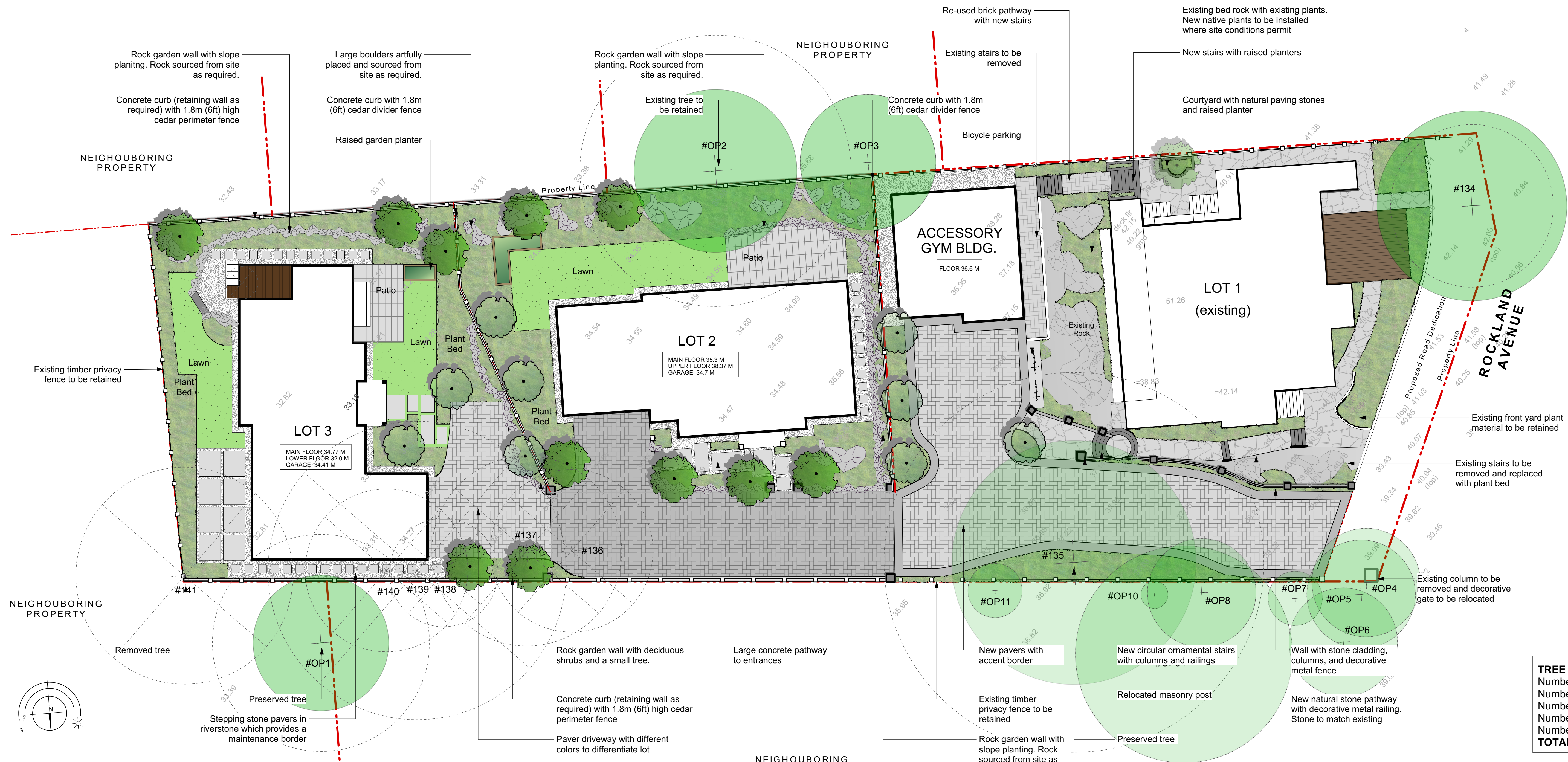
LANDSCAPE CONCEPT PLAN SCALE 1 : 150